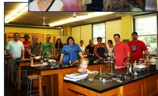
Top: Class of '91 alums step back in time to tour Goretti. Bottom: Reminiscing in the Science Lab.