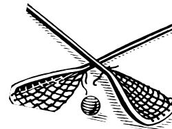
BOYS LACROSSE GIRLS LACROSSE