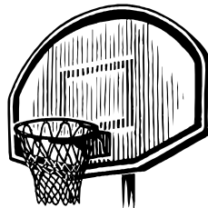
BOYS BASKETBALL GIRLS BASKETBALL