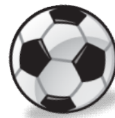
BOYS SOCCER GIRLS SOCCER